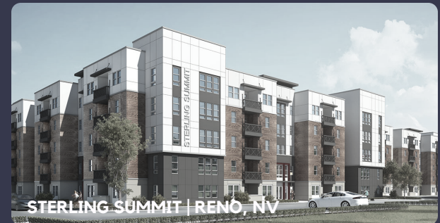
STERLING SUMMIT | RENO, NV