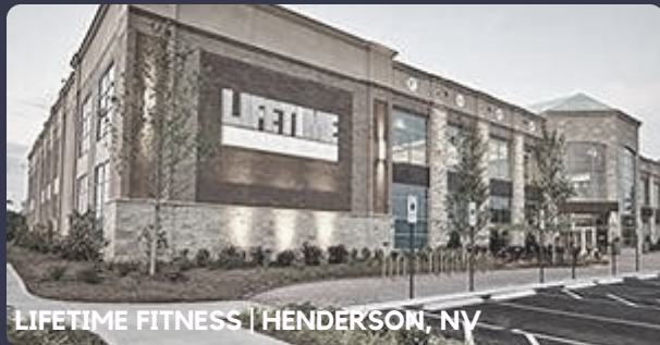
LIFETIME FITNESS | HENDERSON, NV

KATELLA GRAND ANAHEIM, CA PARALLEL APTS, ANAHEIM, CA 5TH & CENTENNIAL APTS, LAS VEGAS BELMONT APTS, LAS VEGAS HAMPTON GARDENS, LAS VEGAS LIBERTY SQUARE, LAS VEGAS LORETO/PALACIO, LAS VEGAS ALTA MONTECITO, LAS VEGAS PAVILLIONS APTS PALLADIUM APTS PARAMOUNT APTS PRESERVE APTS. ELYSIAN AT THE DISTRICT THE VIEW AT HORIZON