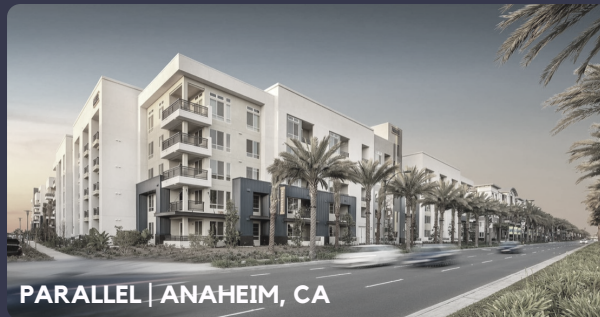
PARALLEL | ANAHEIM, CA