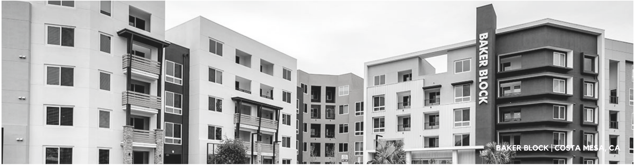
BAKER BLOCK | COSTA MESA, CA

LIFETIME FITNESS GREEN VALLEY LIFETIME FITNESS ROSEVILLE CA HOLIDAY INN EXPRESS NELLIS FA-35 AGE HANGER CREDIT ONE HEADQUARTERS THE JUHL LAS VEGAS LDS 100TH MORMON TEMPLE RENO LDS MOUTNAINS EDGE ARMY DEPOT HERLONG CA CHALLENGER SCHOOL DESERT HILLS CHALLENGER SCHOOL TEXAS COMFORT INN MARKS